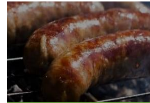
Spolumbo Mild Italian Pork Sausage 2 x 2.75KG (5.5KG Case) $120.00