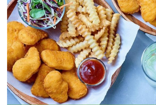
Chicken Nugget (Gluten Free) 2 x 2 KG $80.00