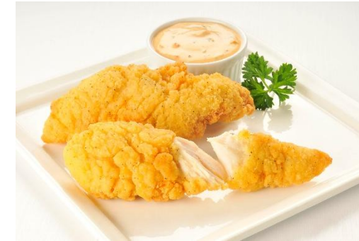
Chicken Tender Parfried 2 x 2 KG $95.00