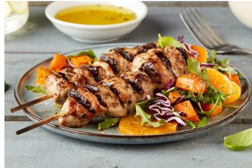
Fully Cooked Pork Kabob Skewer 40 x 85g $105.00