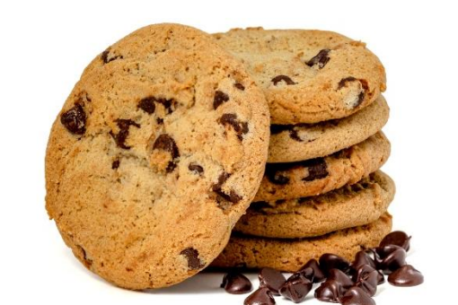
Chocolate Chip Cookie Dough 128 x 57 GR $75.00