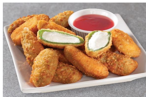
Jalapeno Popper Cream Cheese 2 x 2.5 LB $45.00