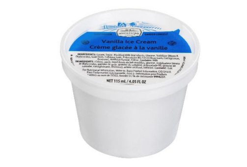
Vanilla Ice Cream Cups 48 x 115 ML $45.00