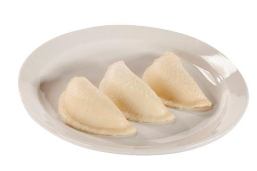
3 Cheese Potato Perogy 4 x 2 KG $35.00