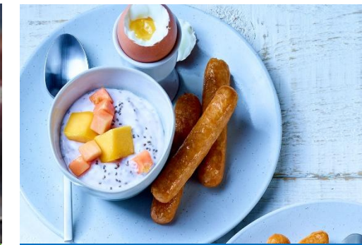
Pork Sausage Raw Gluten Free 1 x 4.54 KG $65.00