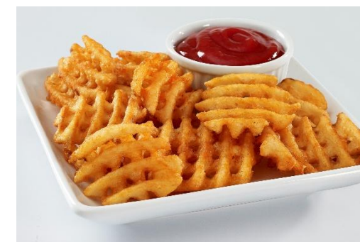
Crunchy Battered Waffle Fries (Spicy) 6 x 4 LB $55.00