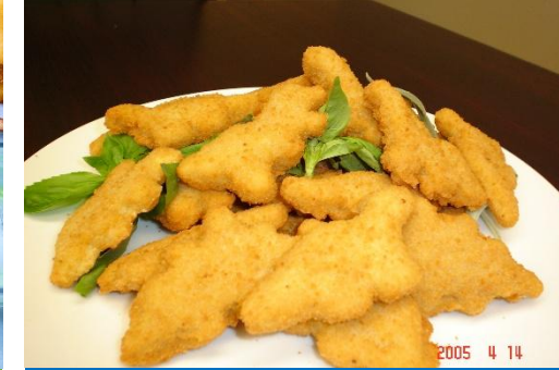
Chicken Dino Nuggets 2 x 2 KG $65.00