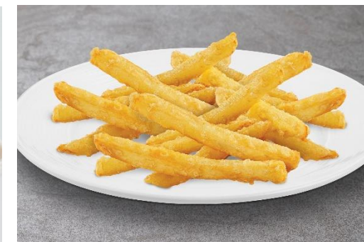
Crunchy Battered Fries (Thin 5/16") 6 x 4.5 LB $55.00