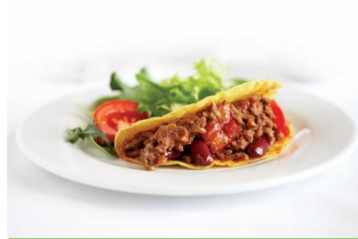
Ground Beef Lean Squares 12 x 1 LB $105.00