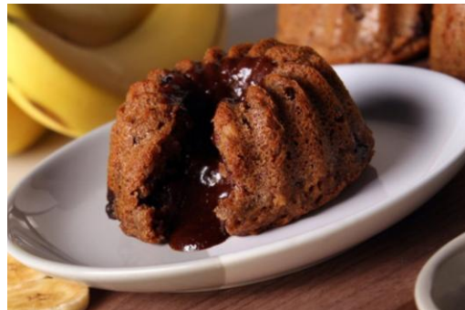
Banana Chocolate Lava Cake (Gluten Free Vegan) 20 x 100 GR $80.00