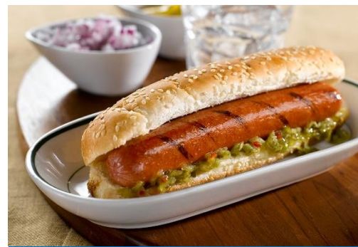
Roller Hot Dog 6" 6/LB 2 x 2.72 KG $65.00