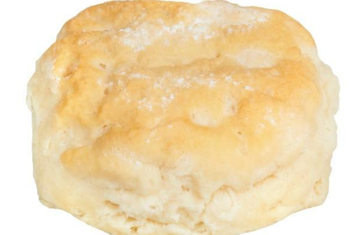
Buttermilk Biscuit (Baked) 120 x 2.5 OZ $100.00