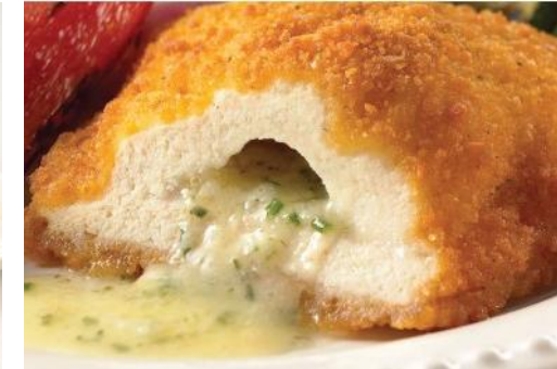
Stuffed Chicken Kiev 24 x 4 OZ $55.00