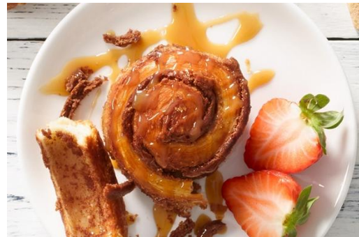
Mini Cinnamon Bun (Ready to Bake) 80 x 50 GR $70.00