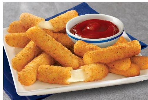
Cheese Stick Mozzarella Breaded 1 x 5 LB $60.00