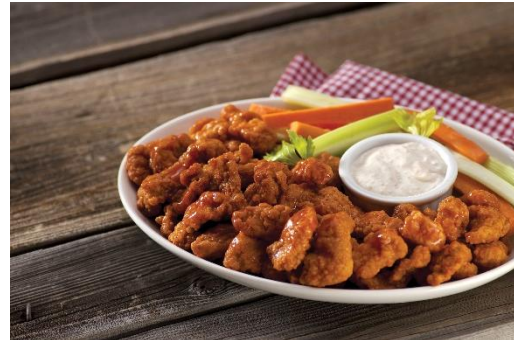
Cooked Boneless Pork Rib 2 x 2 KG $65.00