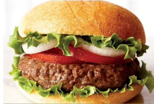
4oz Pure Beef Burger 36 x 4 OZ (8pc x 3 bags) $80.00