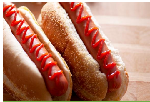
Jumbo Chicken Wiener (Halal) 6 x 10 Count $45.00